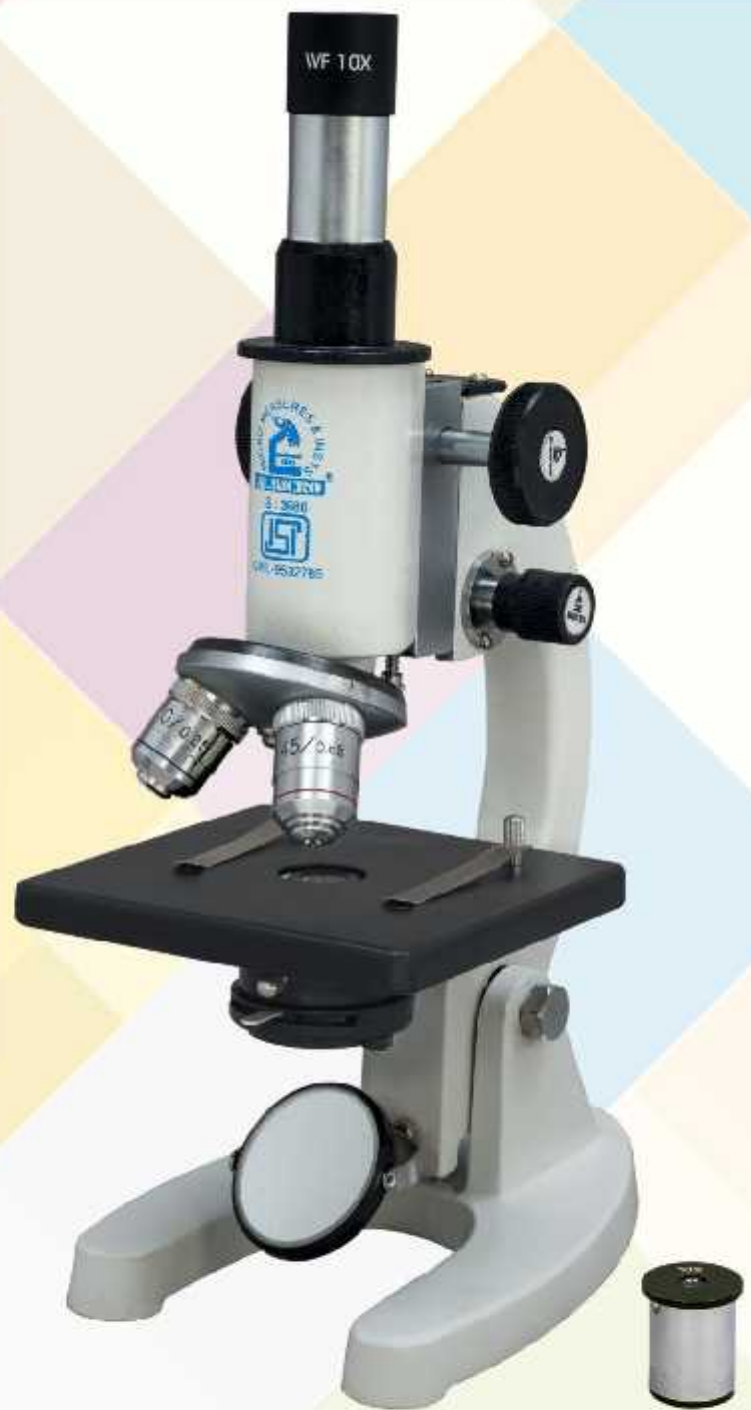
Model : BM3 - ISI

ALMICRO ® Compound Student Microscopes have well designed heavy and sturdy pressure die casted monocular body inclinable to 90° to meet the requirements of School and college students